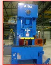
AIDA 150 ton Mechanical High-Speed Press