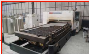
Mazak Super Turbo X510 MKII Potencia Del Laser 2.5KW