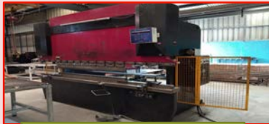
170 ton Press Brake