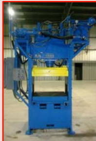
Wilson 100 ton Mechanical High-Speed Press