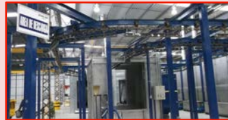
Overhead Roof Crane 3,000n- 5,000 lbs