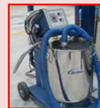
Powder Coating Equipment