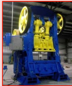
Toledo95 290 ton Mechanical Press