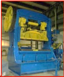
Toledo96 300 ton Mechanical Press